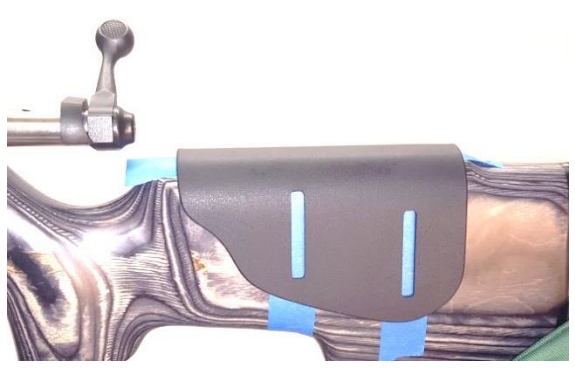
Place the Riser where it is most comfortable for you with the bolt fully open with tape under the slots. Leave room if you would like to remove bolt without lowering the riser if that is possible.