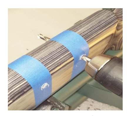
Finish up with the 1/4" bit & drill all the way through