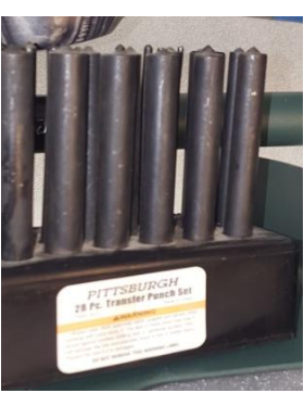
Use a Transfer Punch Set found a Harbor Freight to make dents for your drill marks