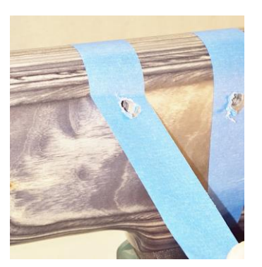
Remove the tape