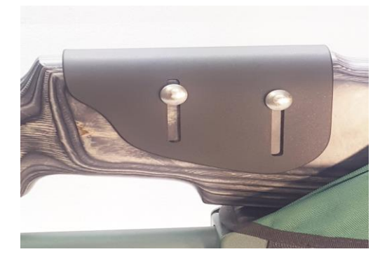
Place the Cheek Rest/Riser over the stock & place the bolts through the slots.