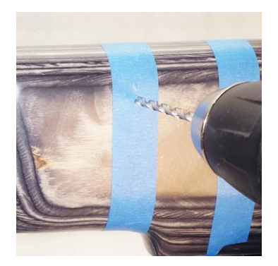
Use the 7/32" bit first & drill half way through on all 4 dented marks, then all the way through