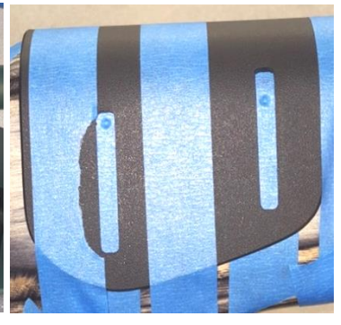
Depending on your stock, make a mark at the top of each slot as I could have done on this Boyd's Pro Varmint Stock. If your stock is narrower at the top of the comb use another transfer punch to space your marks evenly lower on the front slot only.