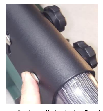
Re-install the bolts & raise the riser to approximate location & Press firmly on the bolt head while tightening the knob.